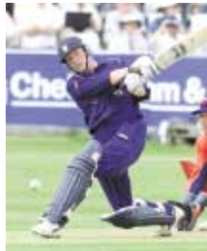
..... Paul Collingwood of Durham Dynamos

In the other Second Division game to take place in this round, Derbyshire Scorpions will hope to put a dent in Glamorgan Dragons' promotion hopes.