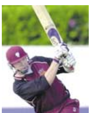
a quickfire 33 not out against Surrey Lions. The Sabres will look to the all-rounder - now

The Sabres went down in disappointing fashion as they found themselves unable to defend a competitive total of 232 and slipped to their third loss of the season.