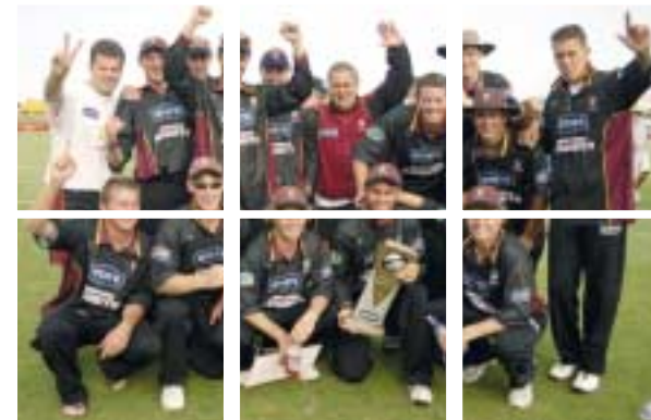
State Shield, 2002/03 – Round Robin Results